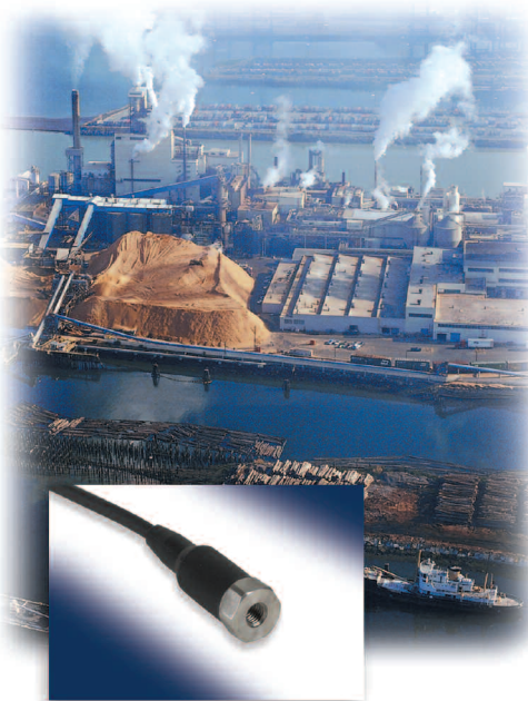
Model 608A11 Industrial ICP ® Accelerometer

As with all equipment from PCB ® , these sensors are complemented with toll-free applications assistance, 24-hour customer service, and are backed by a no-risk policy that guarantees satisfaction or your money refunded.